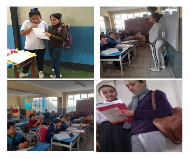
Figure 1: Carrying out the Survey on adolescents in secondary education at the María de los Ángeles Educational Institution N° 3070, in the Puente Piedra district - Lima, 2019.